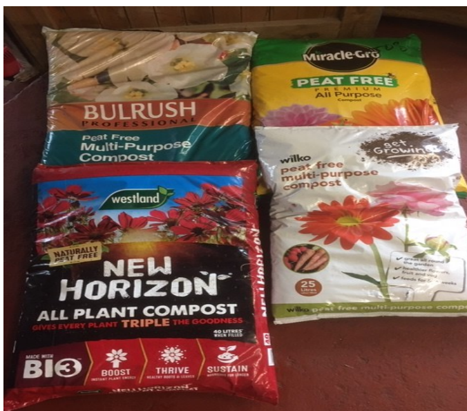
The BRANDS of compost used in the peat free experiment.