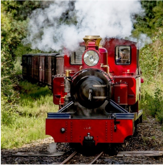
Bure Valley Railway