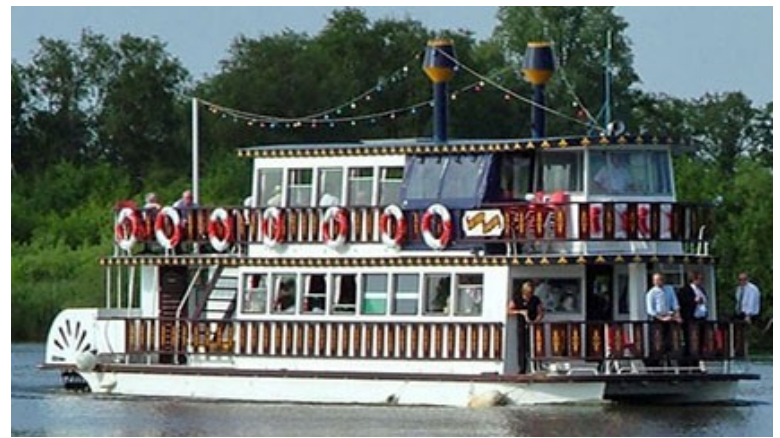
Mississippi Paddle Boat