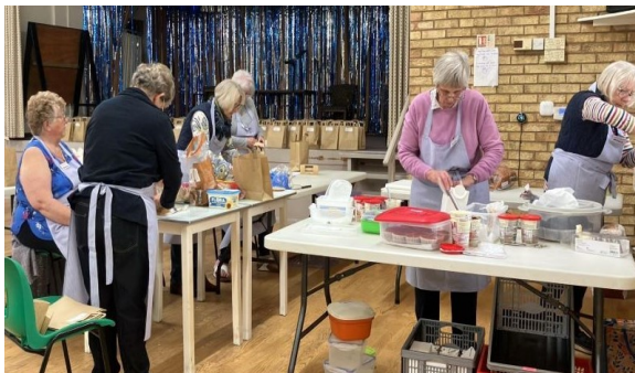
The catering team, hard at work preparing nearly 100 packed lunches, in time for the start of Murder - Death on the Green!